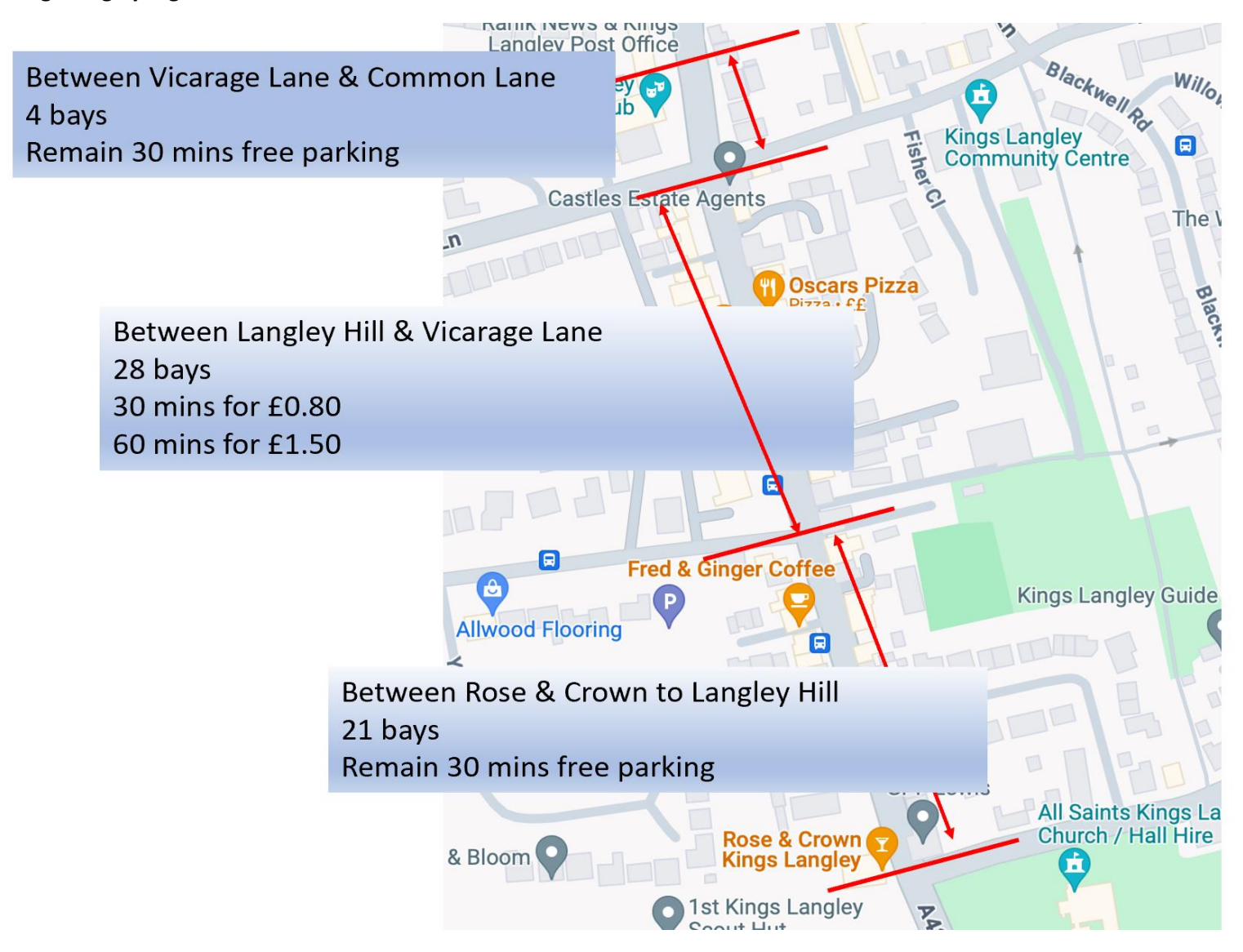
Page 15 of 16